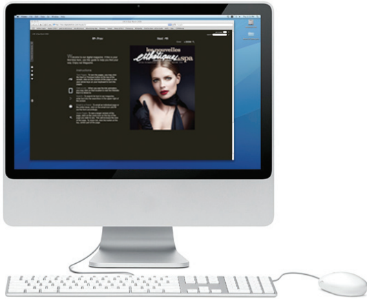
LNE & Spa Interactive Digital Magazine