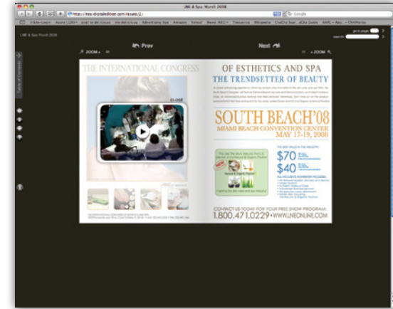
Video, Audio & Advanced Flash Animation Insertion

Today's consumers live in the era of the digital revolution. LNE & Spa is keeping up with the times by featuring the best skin care innovations, spa trends and industry tips in a new, digital format.